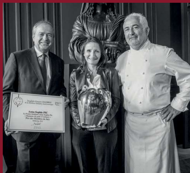
2015: LAUREATE ANNE-SOPHIE PIC