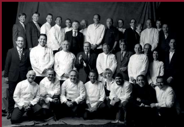
2009: 15 TH EDITION OF THE TROPHÉE & 425 TH ANNIVERSARY OF THE HOUSE