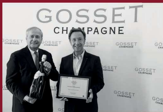
2021: LAUREATE STÉPHANE BERN